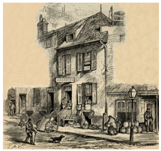
Immigrant boarding house near Castle Garden

eight million immigrants had passed through it.