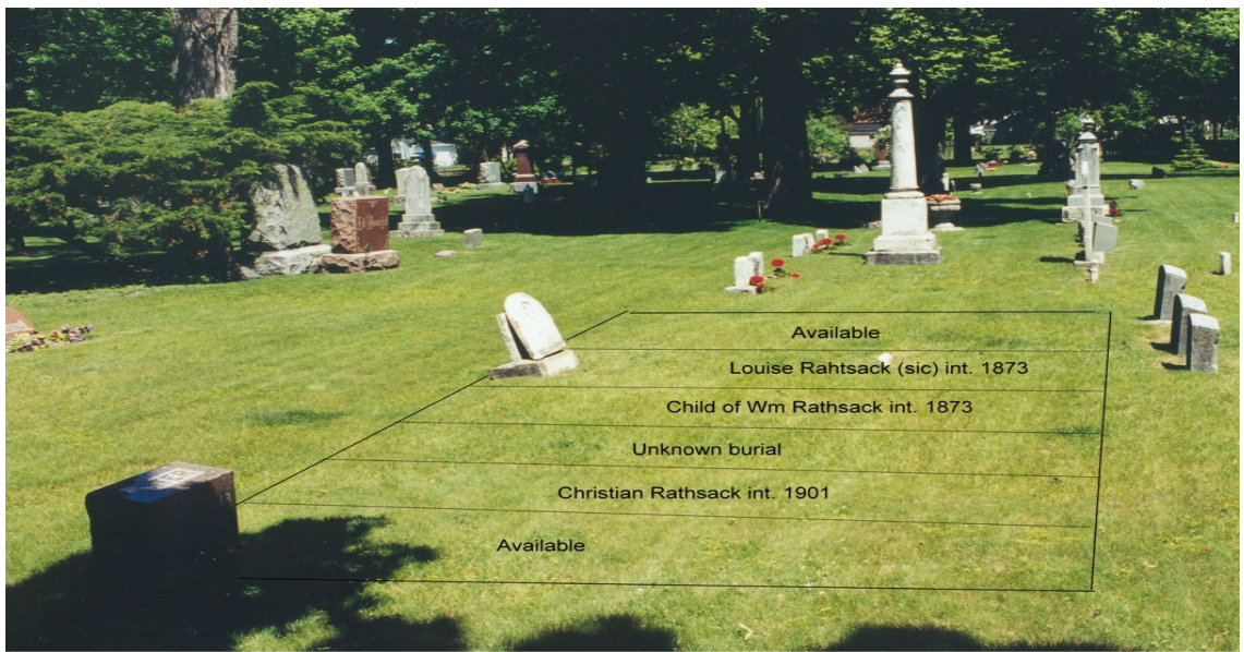
Plot W2-124, Evergreen Cemetery, Manitowoc, WI in June 2003